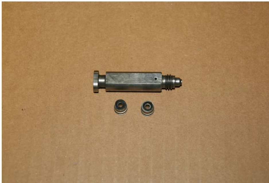
AR5252 mixing chamber and steel side seals for Graco Fusion AP spray gun