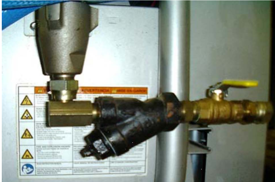
Standard Graco or PMC y-strainer